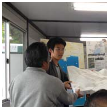
presentation to residents after earthquake (Theme 3) Ikata at Bale-bale in Indonesia (Theme 4)