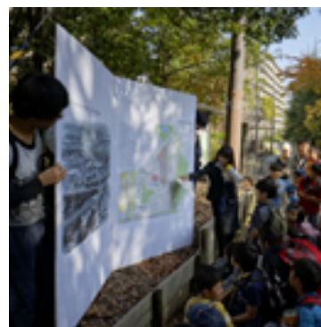
sharing history by the big book (Theme 6)